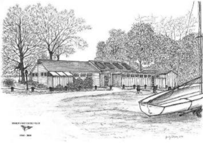
View 1 – From the Road