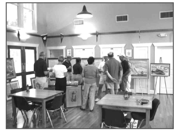
Art on Fishing Bay