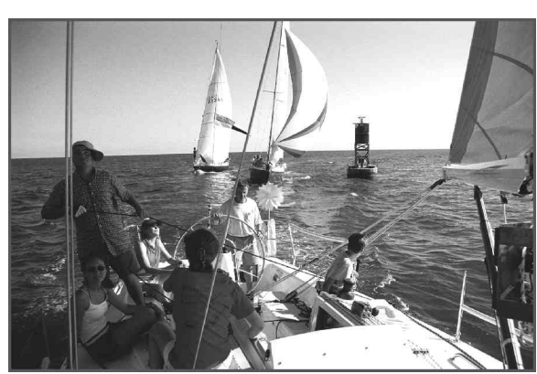
Boats rounding Buoy 57, Smith Point Race

Smith Point Race and NC Cruise - On the Saturday after Junior Week we held our first Smith Point Race in many years. It was scheduled as a joint event with the clubs on the Rappahannock and it started at Mosquito Point. Timed to take advantage of an expected almost full moon and forecast 10-15 knot winds, the 49-mile