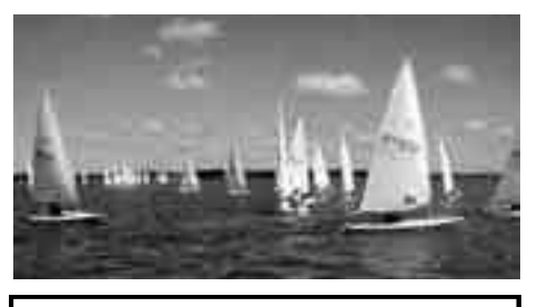
2002 Chesapeake Bay Laser Masters Regatta held at FBYC, Sept. 7-8th

Without exception the parents I spoke to as they were ready to leave said "this is our favorite place to sail, and we'll be back next year". Hearing that makes all the effort well worthwhile.