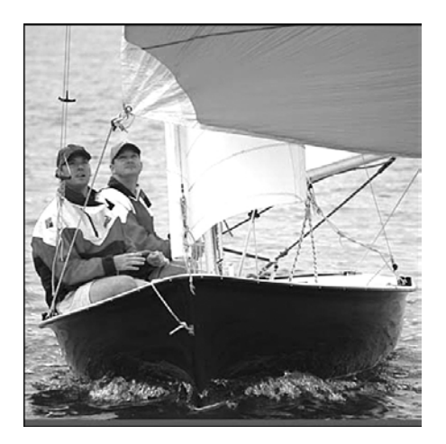
deposited rain and a few bolts of lightning. Ugly rain and high winds also forced the cancellation of races on Spring Series day three.

Spring Series 1 was held on a beautiful Sunday allowing the Frontrunners, Flying Scots, 420's and Lasers to open the season just as they had hoped with 4 great races. Day two found the one design racers huddled in the clubhouse enjoying a pancake breakfast as thunderstorms