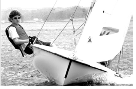
The Junior Beat Rolls On