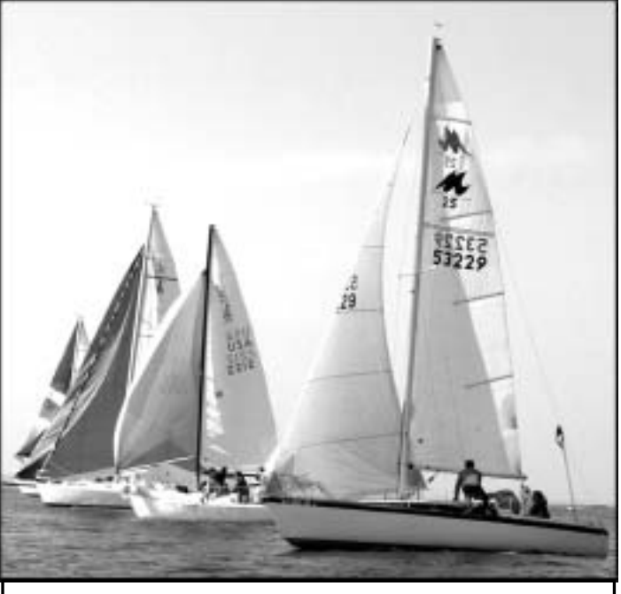
Opening Day At FBYC April 24, 2004

Last month our planning committee recommended we use the new land primarily for parking cars and boats and as a location for Junior Activities on a new beach ramp to be built once we secure zoning approval to use our land. We hope we will receive this from the County at the June 15 Board of Supervisors meeting. My hope is that we continue to enjoy the facility we have inherited, while we work harder at being good neighbors. We have an enviable locale, surely one of the best anyone could find anywhere, period.