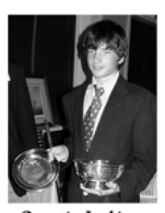
Quentin Jenkins Junior Competition Trophy