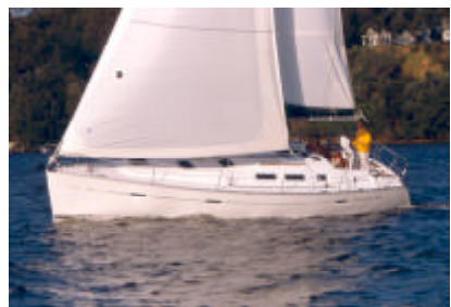
$ 168, 448.00 Including upgraded winches, aircon, electric windlass, commissioning and delivery. In stock, Deltaville.