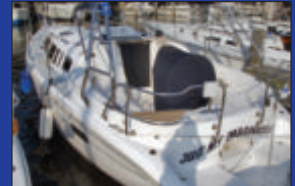
2000 Hunter 340 for $75,000