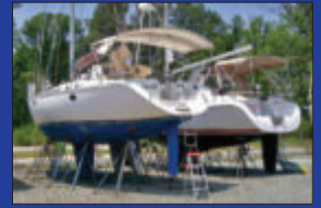
1997 Jeanneau SO45 for $160,000