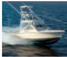
2009 Carolina Classic 28' - $199,785