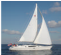
2009 Catalina 309 $109,900