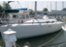
2004 Beneteau 36' $132,950