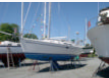
2004 Catalina 310 $87,500