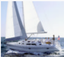
2009 Catalina 350 $199,899