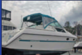
Slickcraft 310SC $39,900