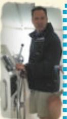
Jim Morrison Log