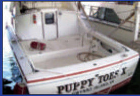
1983 Bertram 28' for $39,000