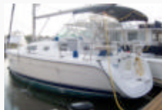
2005 Hunter 27' $59,900

Call and talk to our Brokers (804) 776-9898 www.cysboat.com