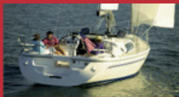
2009 Catalina 309 $104,998