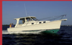
2009 Mainship Pilot 31 $199,000