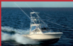
2009 Carolina Classic 28 $178,808