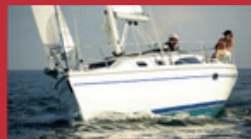
2009 Catalina 350 $184,499