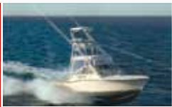
2009 Catalina Classic 28 $178,808