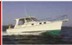
2009 Mainship Pilot 31 $199,000