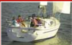
2009 Catalina 309 $104,998