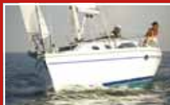
2009 Catalina 350 $184,449