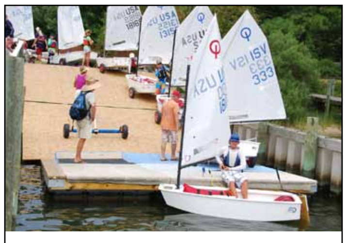
New ramp in use.

As part of the effort to host the 2010 USODA Layline Nationals, some ramps were needed at Deltaville Boatyard to enable launching and retrieving 300+ boats each day. Thanks to the work by Deltaville Boatyard and our site manager Ric Bauer and his volunteers, we were able to build 3 temporary ramps specifically for the event on the marina waterfront. During the 4 busiest days of the regatta, we were able to launch 263 boats in an average of 36 minutes using just 2 of the 3 ramps. We want to thank Deltaville Boatyard and its slip holders for enabling us to build the ramps and host the regatta on its property.