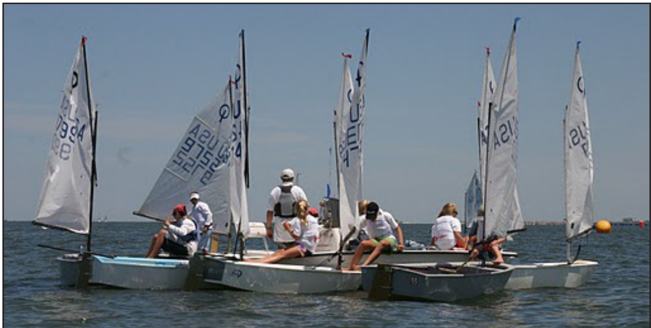
Hampton YC Regatta 2010