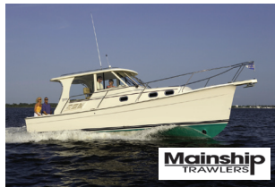
2009 Mainship Pilot 31 $189,000