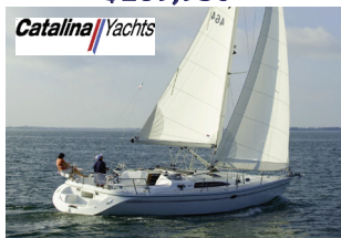
2009 Catalina 350 $179,900