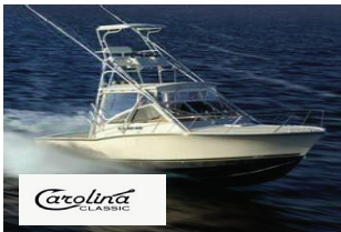
2009 Carolina Classic 28 $169,950