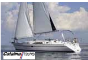
2011 Catalina 355 $199,489