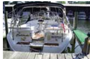
2007 Hunter 38 $149,950

Large Inventory Pre-owned Power & Sail (877) 218-1575 www.cysboat.com