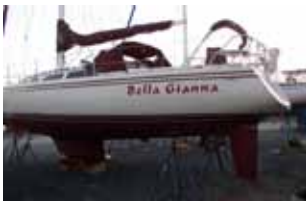
1991 Catalina 34 $52,900