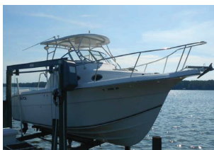
2006 Sea Fox 29' $39,900