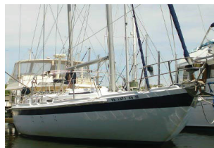
1980 Custom 43' $47,500