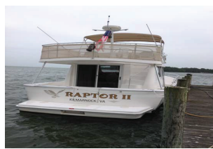
2002 Mainship 39' $134,500

Annapolis Sailboat Show October 9-13 Large Inventory Pre-owned Power & Sail (804) 776- 9898 www.cysboat.com