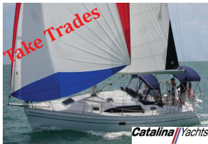
New 2014 Catalina 315 $133,012