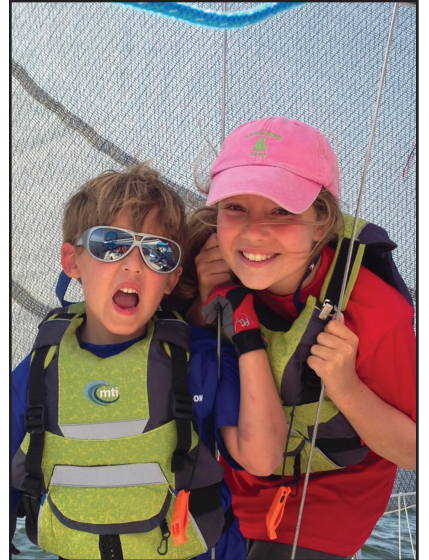
Smiles after the race.

I started thinking, if we didn't sail in the Cut Channel race because we were worried it would be too much for them, just think about all the experiences they would've missed that day. So as a parent. a sailor, and racer, my advice is get your kids out there early. Let them share in the experience: I