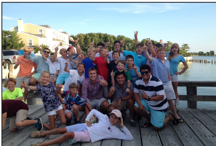
Members and coaches of the 2014 FBYC Opti and Laser Race Teams visit Oxford, MD, for the Tred Avon Yacht Club Annual Junior Regatta