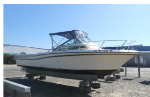
1997 Grady White 22' $16,000

Free Sailing Seminar 2/21/2015 contact onna@dycboat.com