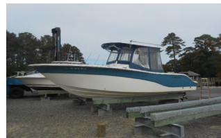
2009 Sea Fox 25' $37,900