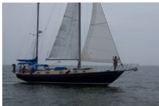
1970 Morgan 40' $49,500