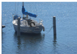
1981 Sabre 30' $17,900