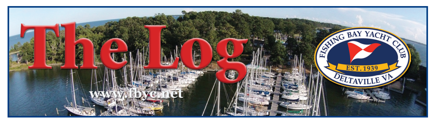
FROM THE QUARTERDECK