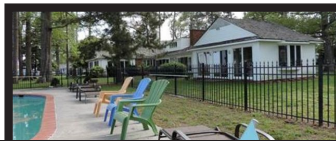
Open House Sunday, June 21 from 2 to 4 370 Stove Point Rd. Deltaville, VA 23043 Chesapeake Bay Views ~ $1,200,000