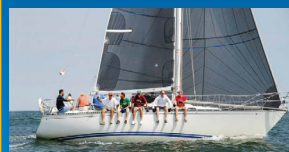
1983 C & C 37 'Wavelength' $33,500