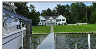
Ridge Road $1,100,000