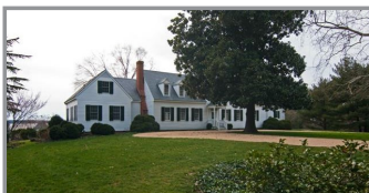
Pigeon Hill $1,195,000