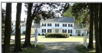
Bay View $1,650,000