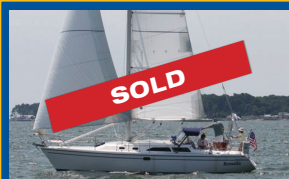
2002 Catalina 36 Mk II 'Reveille' $94,500