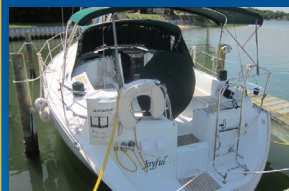
2004 Beneteau 361 'Joyful' $95,000