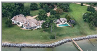
Burton Point $1,765,000