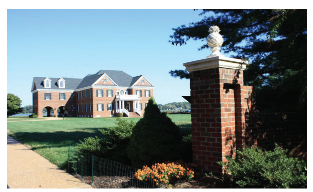
CRANEFIELD Offers Sought

Exquisitely designed 3-story brick home prominently situated on 4.76 acres at the end of a country lane with dramatic water views. 450' feet of frontage along the Ware River with approximately 5 feet MLW at the dock. Detached garage with guest quarters above.