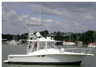
1997 Luhrs 32' $54,000