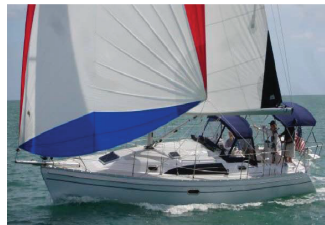
New 2015 Catalina 315 $137,153