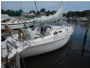
1983 Ericson 33' $14,900