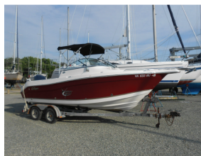
2011 Striper 21' $44,000