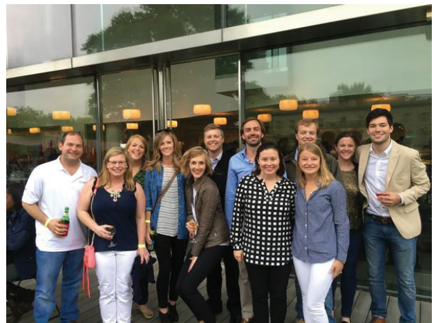
The Young Adult Member group had a great happy hour meeting up at the VMFA to catch up and talk sailing this spring!