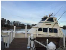
1968 Hatteras 50' $229,000