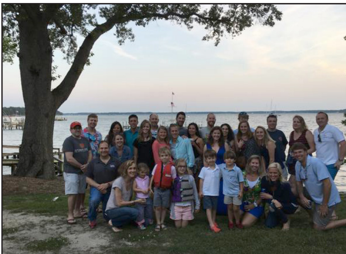
The Young Adult Member group had a great time at the 3rd Annual YAM Cookout at the club!