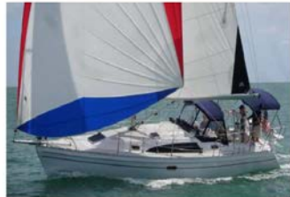
New 2015 Catalina 315 $137,153