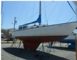
1969 Cal 36' $22,000