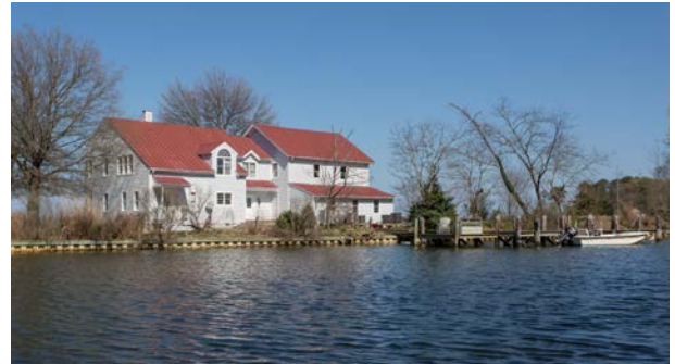
1120 CHAPEL LANE

4+ acres surrounded on two sides by the Piankatank River. The original, historic warehouse has been fully restored and is now a 4 bedroom 3.5 bath home, with water views from every living space, in 1987.