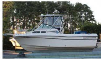
2005 Grady White 23' $49,500