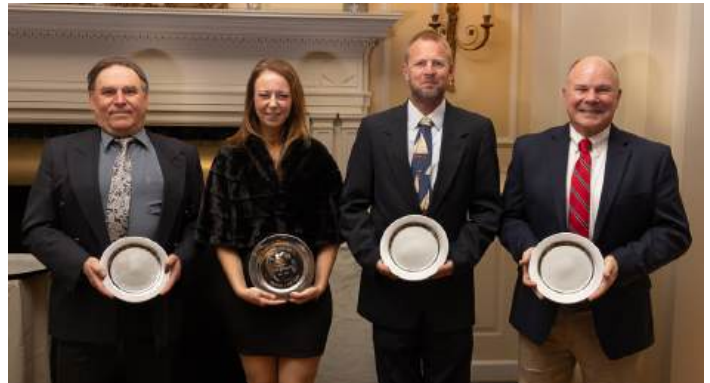
2024 ALLEN B. FINE TROPHY - Corryvreckan Crew