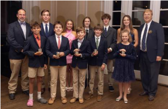
2024 Junior Award Winners