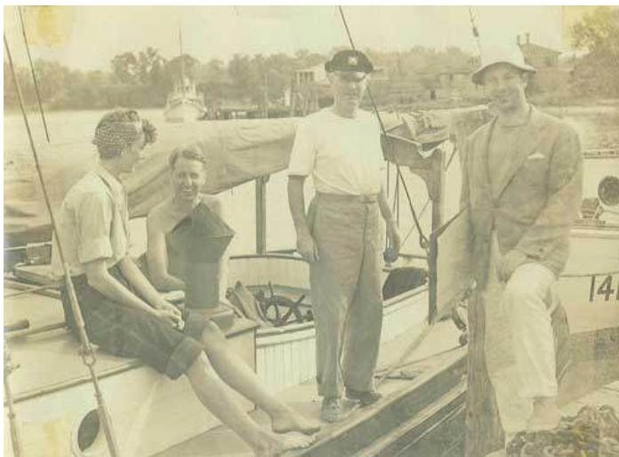
Urbanna Commodores and Founder.