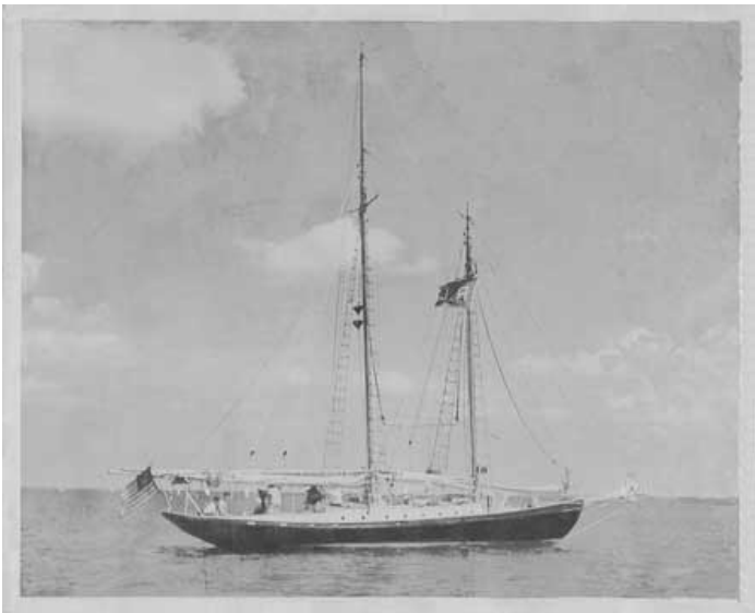
The schooner Nighthawk on race committee duty for the Cruising Division during UYC's Virginia Sailing Regatta in 1944 off Urbanna.