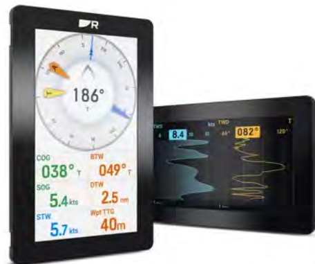
Raymarine Alpha Display