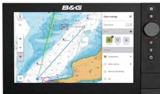
B&G Zeus SR