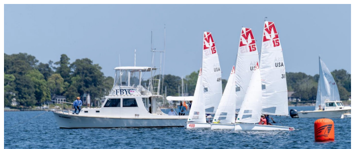
Melges 15 start a race - 2024.