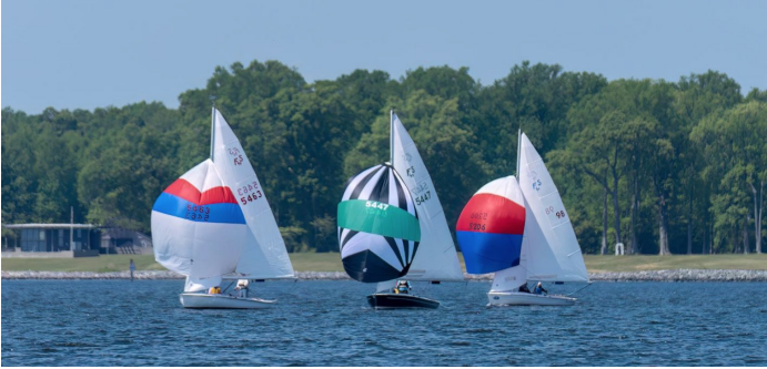
Flying Scots on the race course – 2024.